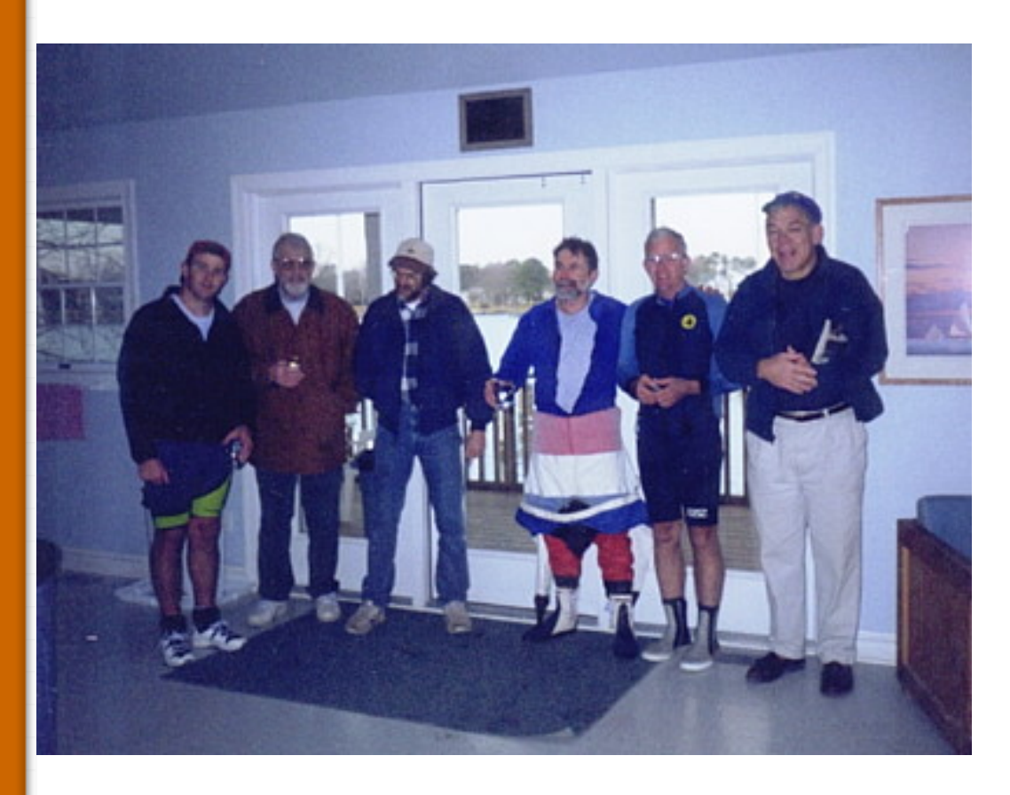
More Frostbiting Pictures