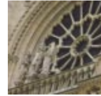
Notre-Dame dates back to the 13th century and is one of the masterpieces of Gothic art in Western Europe.

Throughout France, tourist offices can ease your journey logistically and financially. They provide city maps, lists of hotels, and reservation services. Tourist destinations are hot spots in Paris.