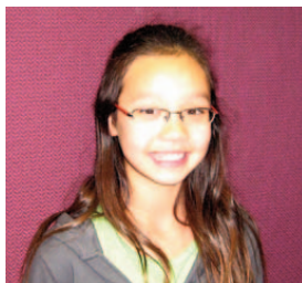
by Baylee Rogers