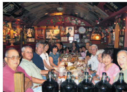
After playing, crafting, singing, and teaching, it was time for quiet fellowship among the caregivers. The Fall 2007 session of MOPS ended with a great treat for the caregivers—a lunch at Buca di Beppo! The Winter 2008 session begins on January 29. Are you ready, caregivers? †