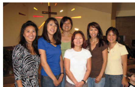
The MOPS committee, the mothers, moppets, and toddlers appreciate your time, energy, and compassion that you lovingly bestow every Tuesday.