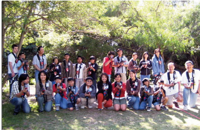
HUGS vs. 777 or, MATURE vs. YOUTH