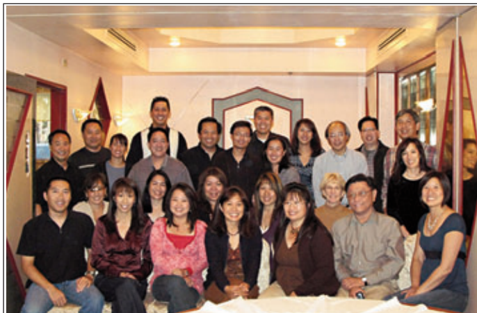
HALF A CENTURY OLD!!