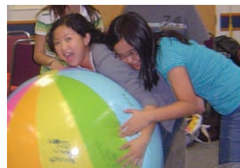
KFC sleepover at church

HUGE THANKS to everyone who helped cook, serve and clean with the KFCers! The kids had a great time and we couldn't have done it without so much help.