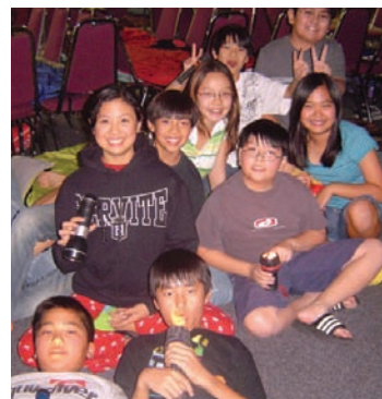
KFC sleepover at church