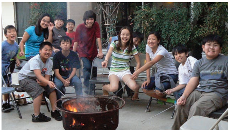
Roasting hot dogs at the fire pit.