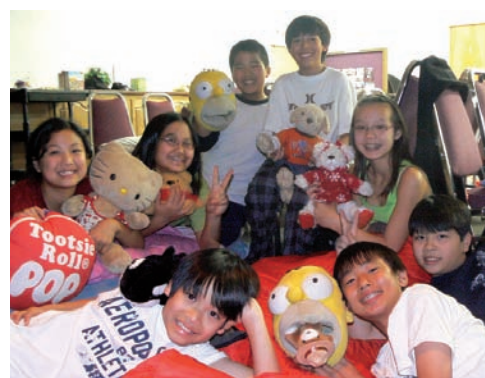
We're not ready for bed!