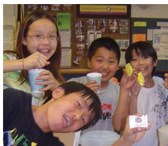
KFC sleepover at church