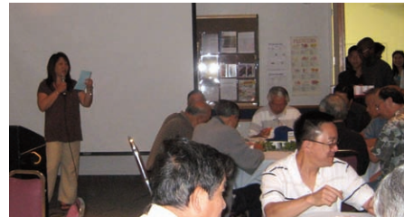
table for the dads. Beautifully decorated tables made the food taste all the better. Our dads are very special at CUMC!! †

feted moms with last month, the women put a superlucious feast on the