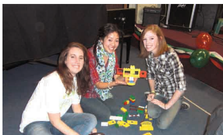
Are we building a better mousetrap?