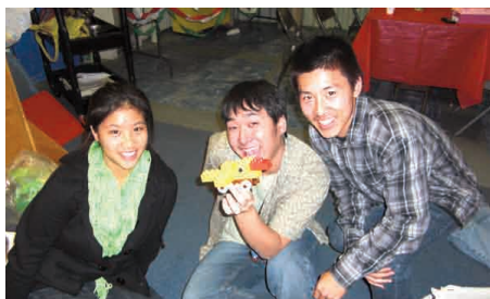
My car is better than your car.