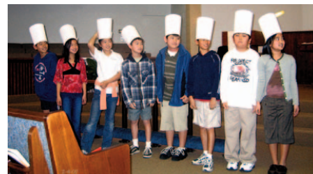
KFC'ers were the student chefs

Mission Sunday on February 4, 2007 was SOUPER BOWL Sunday. A Missions Skit featuring guest chef, Emeril and his student chefs being interviewed by Rachel Ray was featured during the Children's Moment. The previous Sunday, our committee distributed grocery bags with two lists of food items for a family of four and for homeless individuals to be brought back to church on Souper Bowl Sunday. It was truly a SUPER SUNDAY. We collected 26 bags of food items for families of four and 15 bags of food items for homeless individuals. What a generous congregation we have as our Student chefs collected $861.27 in Mission offerings