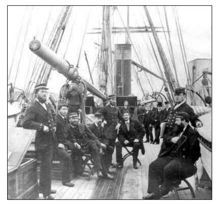
Officers on deck of the steamship Idaho

Life aboard seemed to be uneasy for the emigrants, according to this citation from a passener: ".... You can imagine what an unpleasant journey it was with over 1,100 emigrants, crammed together, most of us were treated worse than wild animals. We hardly ate anything at the start of the journey since we are not pigs, but when we began to understand the situation and our own provisions were nog enough, we had to accept the food that the pigs ate ... when we walked on deck the muck went over our Shoes and into the meat container, one should wash it but the Irishmen had washed their children 's messes and night pots first ..."<sup>ii</sup>