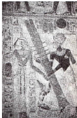
Depiction of the ladder to heaven

“Hail to you, Ladder of the God. Hail to you, Ladder of Seth. Stand up Ladder of God. Stand up Ladder of Seth. Stand up Ladder of Horus, which was made for Osiris that he might ascend on it to the sky and escort Re . . . [and in the same utterance a little later] . . . Now let the ladder of God be given to me. Let the ladder of Seth be given to me, that I may ascend on it to the sky and escort Re as a divine guardian of those who have gone to their doubles.”