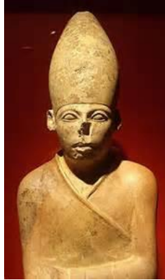
Image of King Khasekhemwy

the distinction of being the only Egyptian ruler to have a serekh showing only the god Seth. Identifying the king with Seth instead of Horus is obviously an important political move and highly controversial, suggesting strong lingering conflict between the Horus and Seth cults.