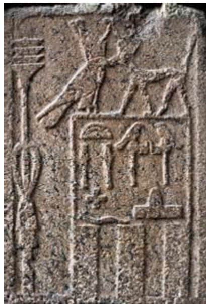
Only serekh depicting both Horus and Seth

The successor to Seth-Peribsen was Khasekhemwy, whose name means “The Two Powerful Ones Appear.” This is him above. He was the last king of the second dynasty and he too has a distinction. He is the only Egyptian ruler with a serekh that includes both Horus and Seth. A depiction of which we can see here