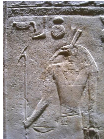
Mages of the Egyptian God Seth

Horus and Seth are two of Egypt's oldest deities, with roots going back to pre-dynastic times (before 3000 B.C.E.) Horus is associated with the falcon but Seth, as you can see in the pictures above, is represented by some sort of strange creature dubbed the "Seth animal" because no one is quite sure what kind of animal it is or whether it might be a composite of more than one animal. The relationship between these gods is complicated and, as we shall see, there is some confusion over the nature and identity of the god Horus.