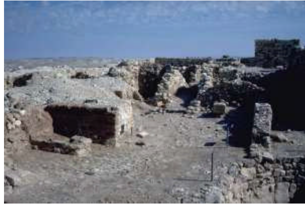
The temple was in ruins-Haggai urged rebuilding

Haggai prophesied in Jerusalem about 520-515 BC, not long after some Jews had returned from exile in Babylon. He was a contemporary of Zechariah .