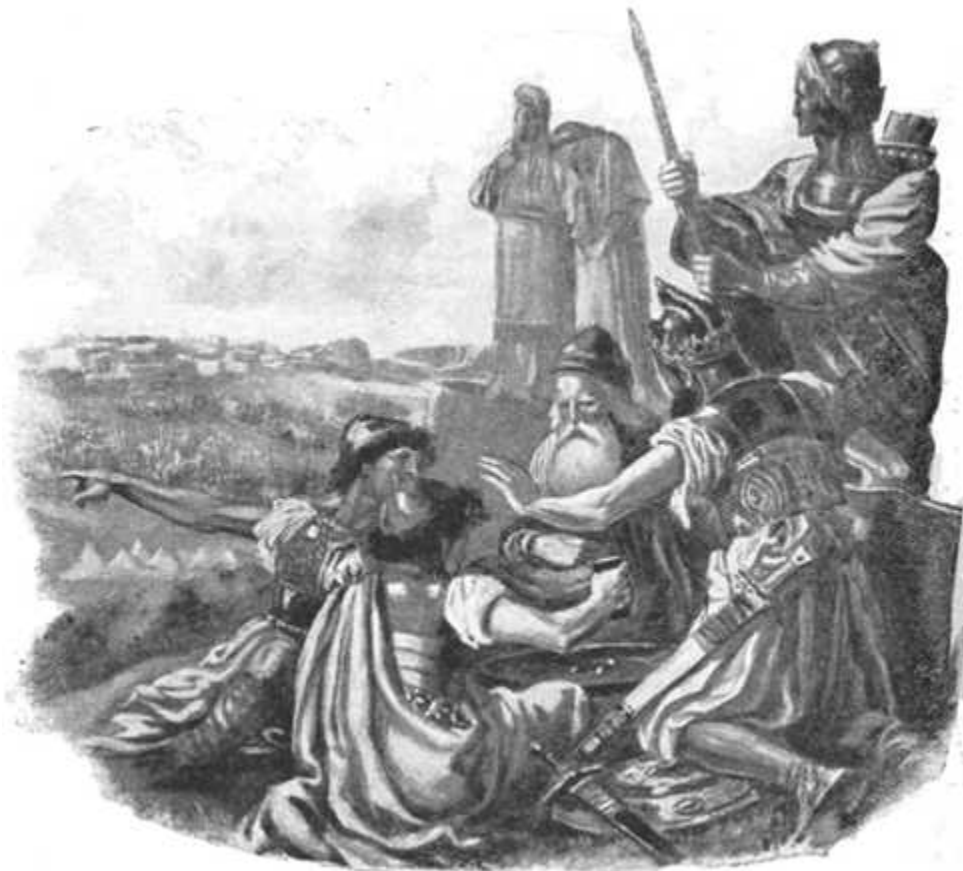
"And cast lots upon Jerusalem."— Obadiah 1: 11.