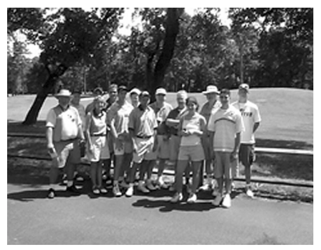
Golf enthusiasts enjoyed Sunday's outing at Arcadian Shores Golf Club.