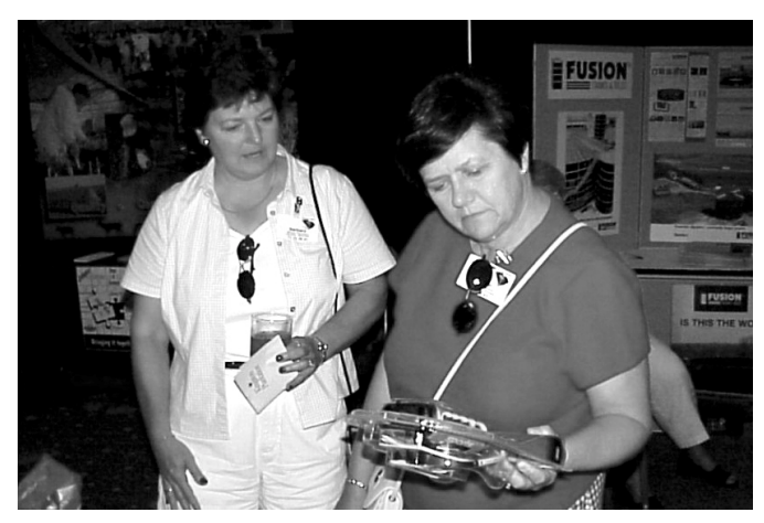
The silent auction drew a number of bidders.