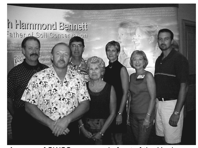
A group of SWCSers poses in front of the Hugh Hammond Bennett display.