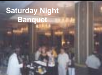
Saturday Night Banquet

Do it ALL with your Lima Brothers, Family and Friends!