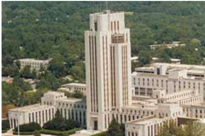
NNMC, Bethesda, Md.

Official Newsletter of Le Grand Voiture de Maryland, Inc. La Societe des Quarante Hommes et Huit Chevaux, Grande du Maryland D12796272; EIN 26-3721723