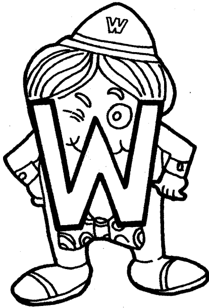
MISTER W – WINKING