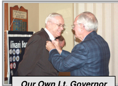
Our Own Lt. Governor Installs the New President