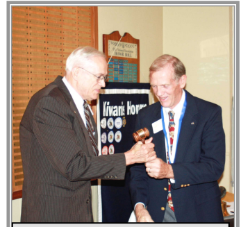
The Gavel is Passed