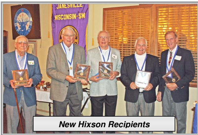
New Hixson Recipients