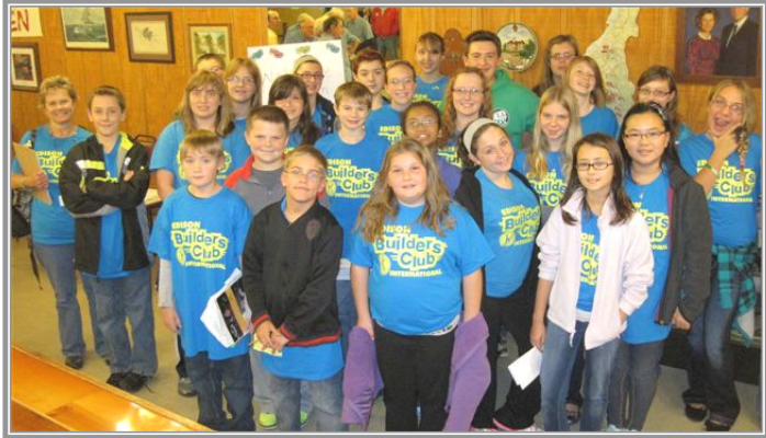
Builders Club – Edison Middle School Joined us at our meeting on Oct. 17