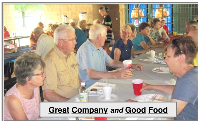
Great Company and Good Food