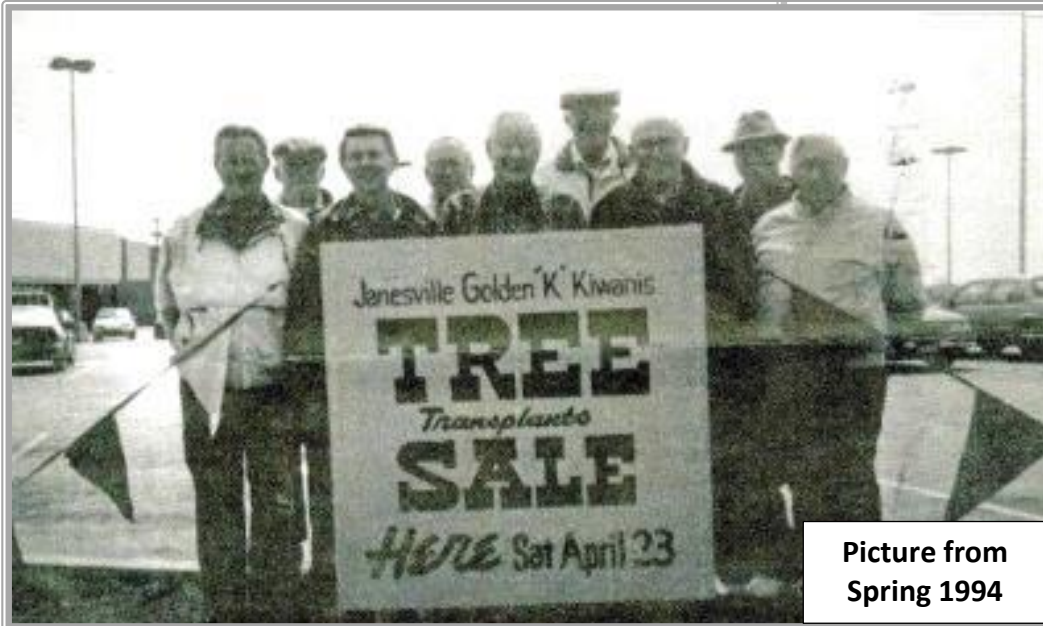
Picture from Spring 1994