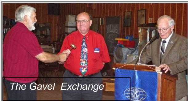
The Gavel Exchange

When October comes along I usually think of that scary time called Halloween, but this year I look forward to serving as president of the Blackhawk Golden K. Having joined in 2011, I do not have the history of what we always do and in what way. Many questions will spring up in my head and I will seek answers/input. I greatly appreciate the willingness of the membership to be of assistance.