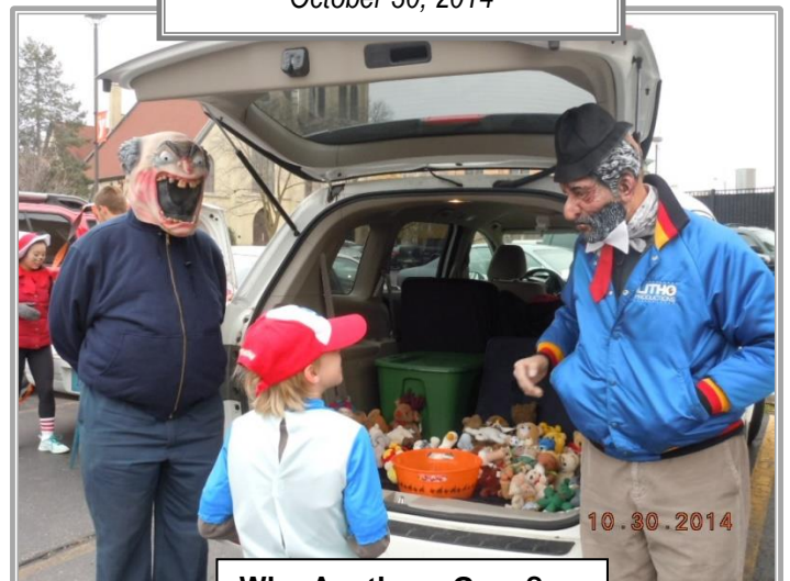
Who Are these Guys?