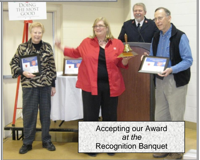
Accepting our Award at the Recognition Banquet