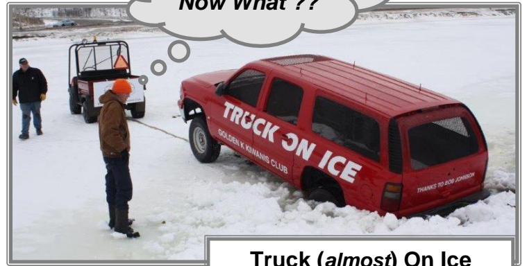
Truck (almost) On Ice February 11, 2015