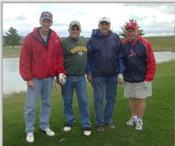
The Winning Team !

You can be part of another fun filled morning of golf ! September 24, 2015