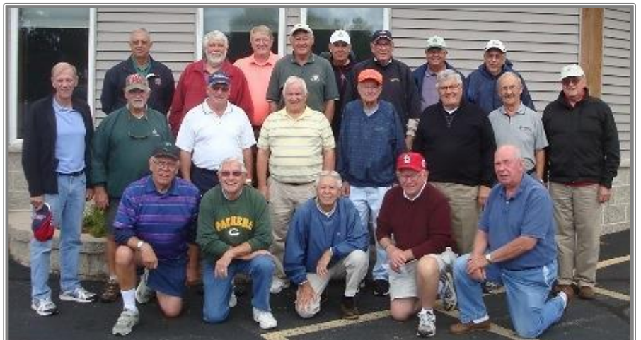
What a Great Looking Group !!

Just sign up to play for our last golf outing of the year !!