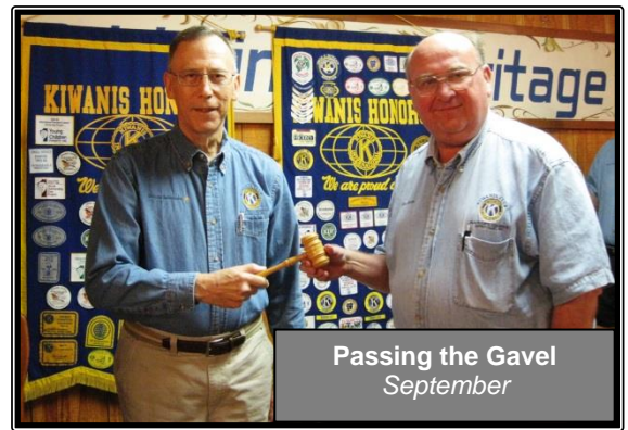
Passing the Gavel September