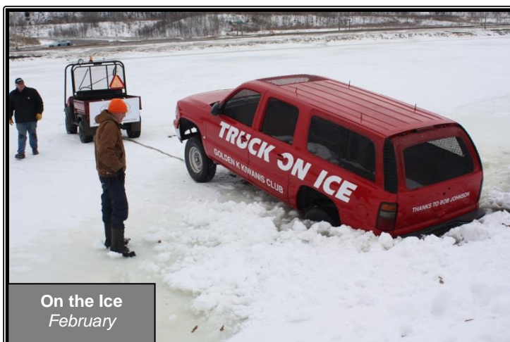
On the Ice February