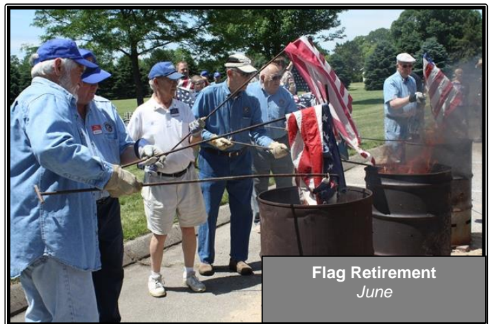
Flag Retirement June