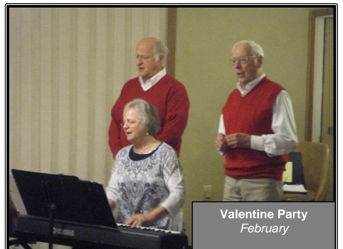
Valentine Party February