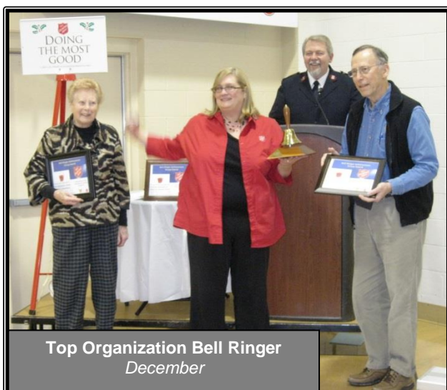
Top Organization Bell Ringer December