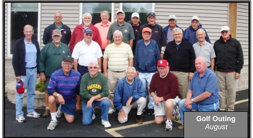
Golf Outing August