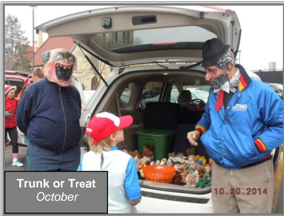
Trunk or Treat October