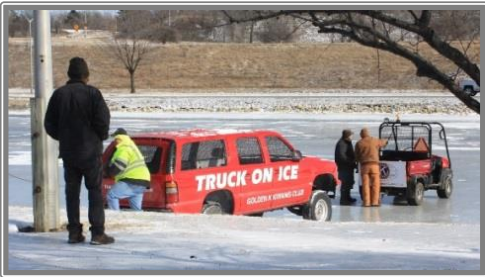
Feb 10, 2016 Pulled Out on the Ice