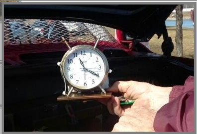
The Clock is Read Winning Time is Determined