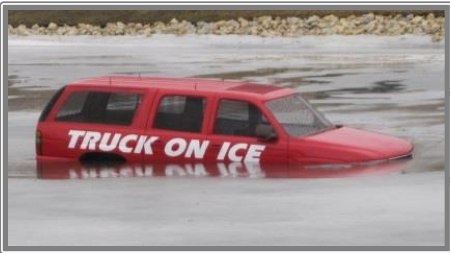
Feb. 19, 2016 The Clock Stops