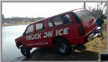
Mar 09, 2016 Pulled from the Laqoon