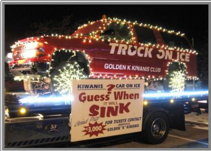
Dec. 05, 2015 Introduced to the Public Jolly Jingle Parade