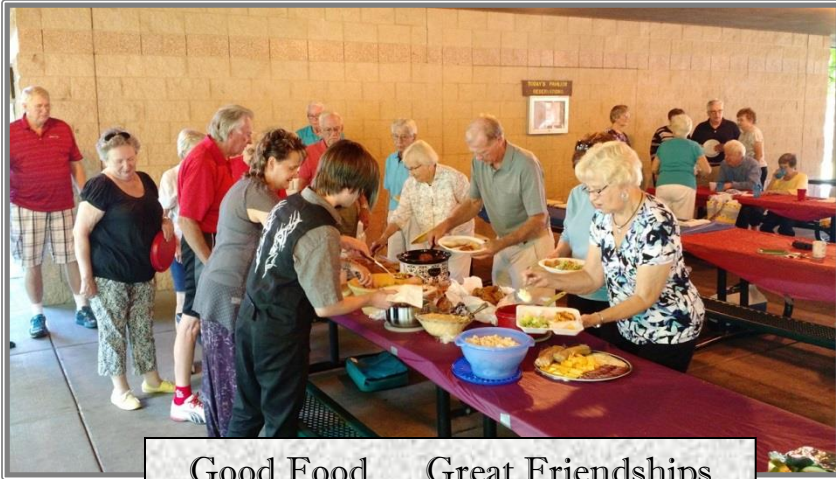
Good Food Great Friendships