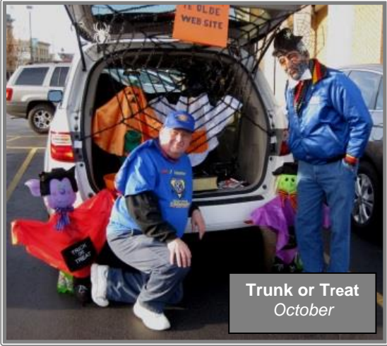
Trunk or Treat October