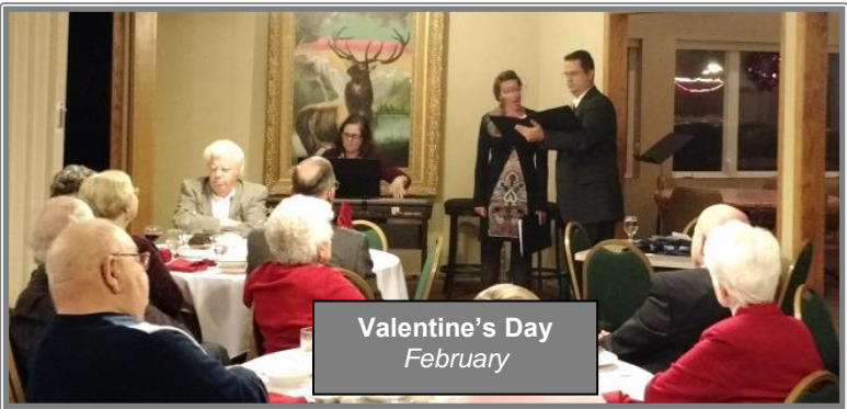
Valentine's Day February