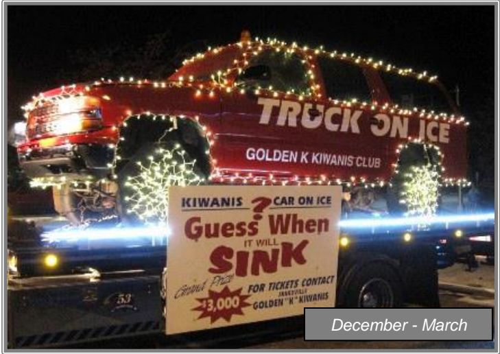
December - March