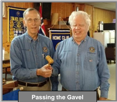
Passing the Gavel September