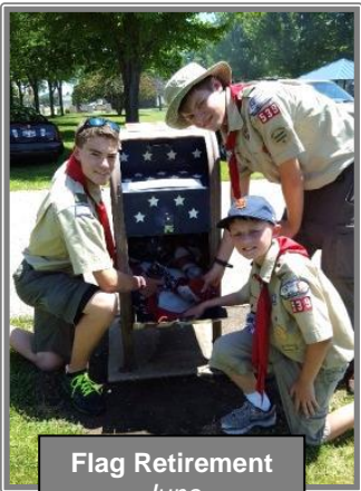
Flag Retirement June