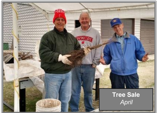
Tree Sale April