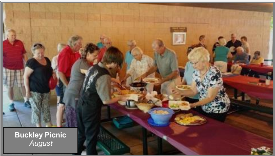
Buckley Picnic August