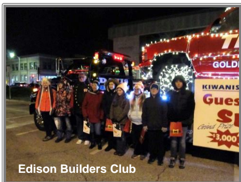
Edison Builders Club