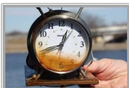
The Clock is Read Winning Time is Determined to be 12:42 pm