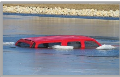
Feb. 12, 2017 Plop, Down she goes The Clock Stops