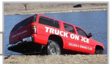
Feb 22, 2017 Pulled from the Lagoon