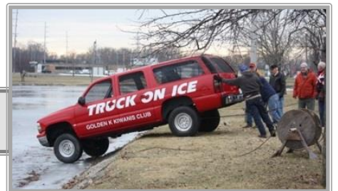
Feb 11, 2017 Launched out on the Ice