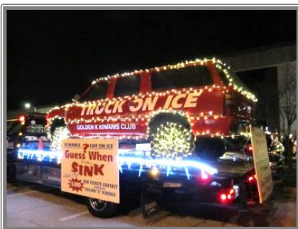
Dec. 03, 2016 Introduced to the Public in the Jolly Jingle Parade