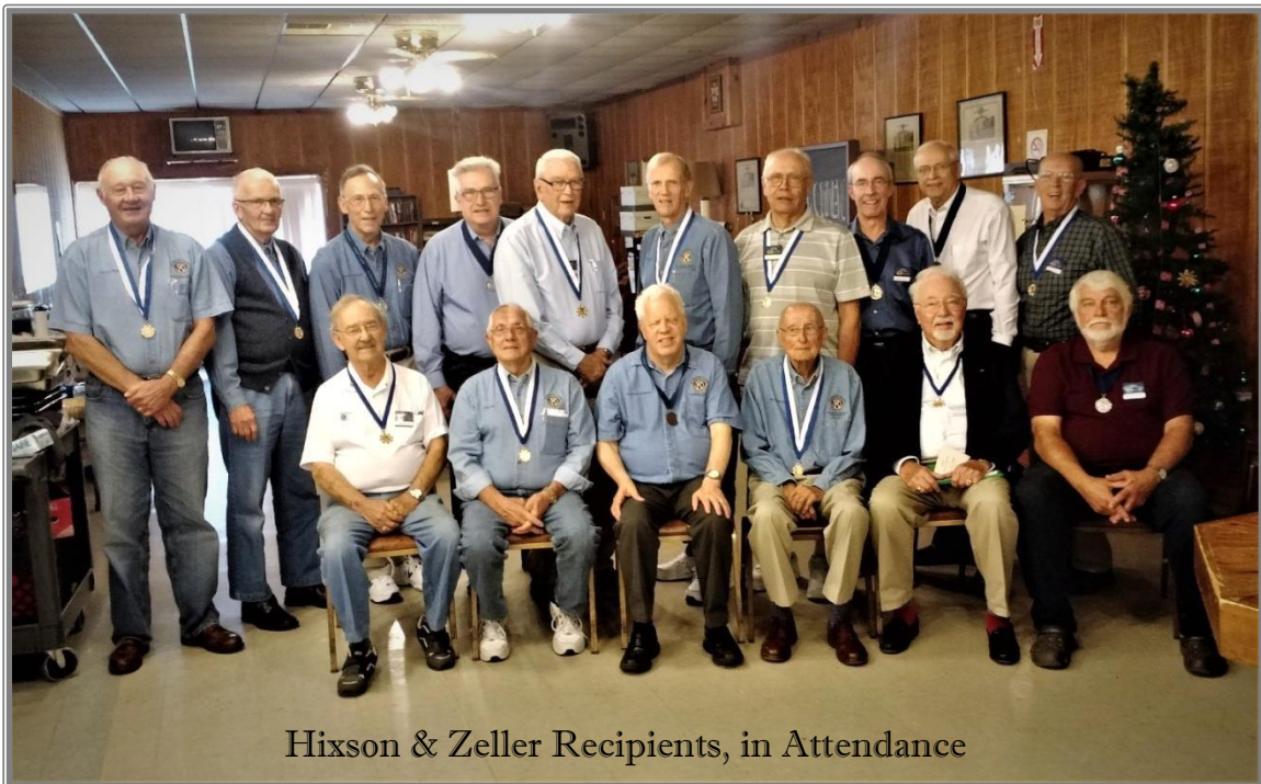
Hixson & Zeller Recipients, in Attendance