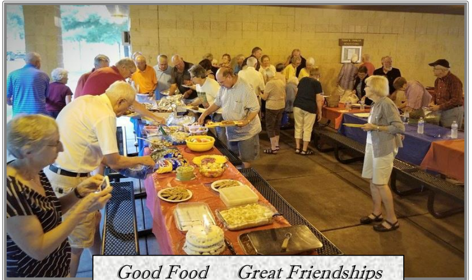
Good Food Great Friendships