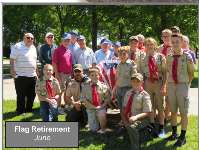
Flag Retirement June