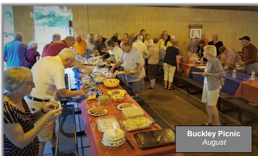
Buckley Picnic August