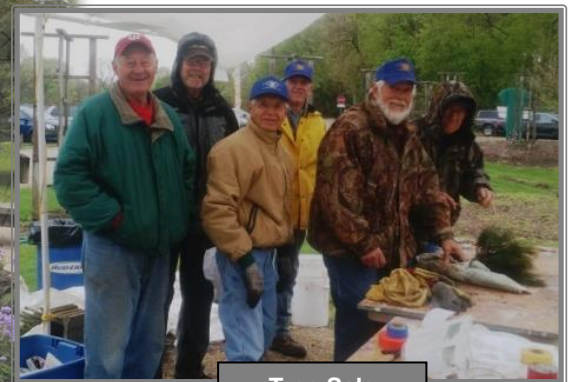
Tree Sale May