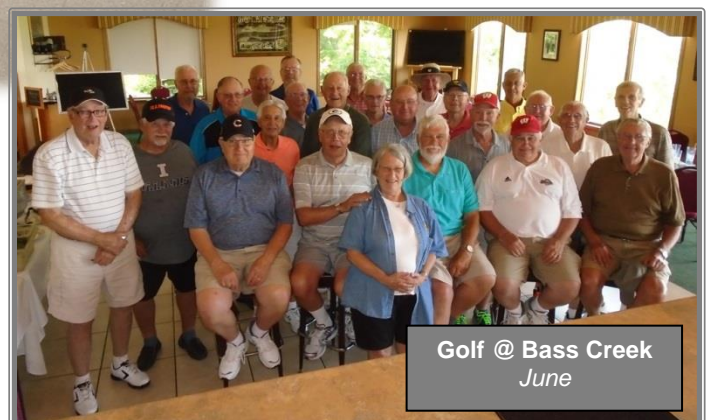
Golf @ Bass Creek June