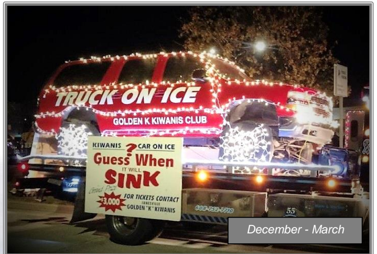
December - March