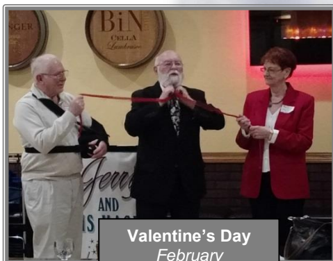
Valentine's Day February