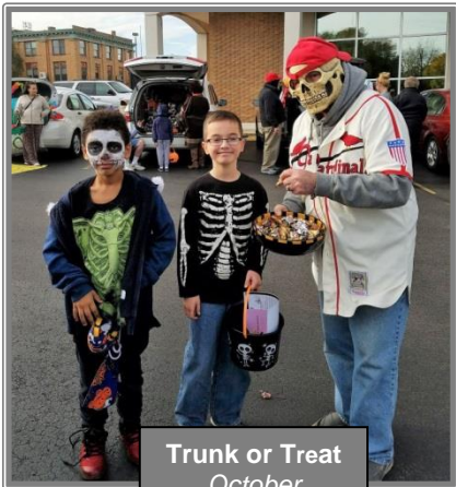
Trunk or Treat October