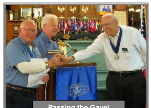
Passing the Gavel September