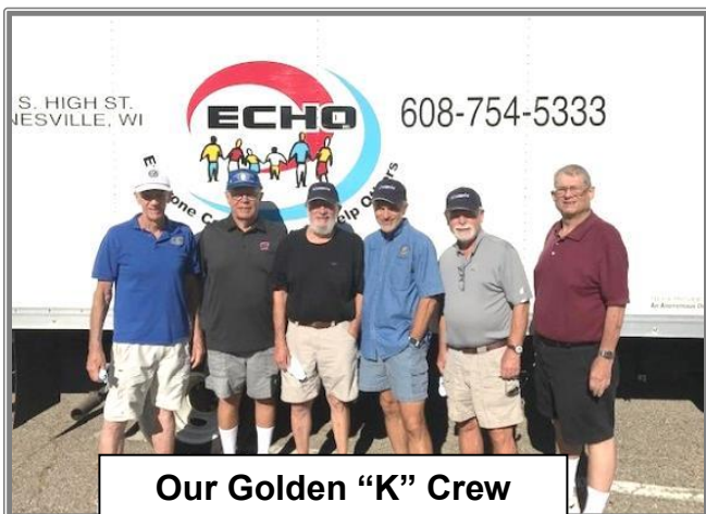
Our Golden "K" Crew