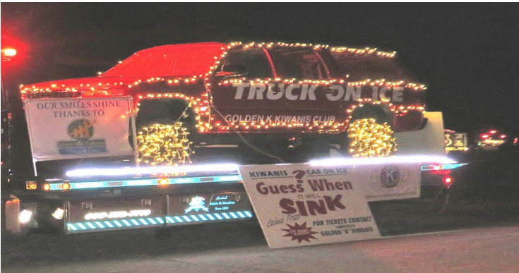
On display at Traxler Parrk

Advice Center of gravity Horseback riding Diamond ring