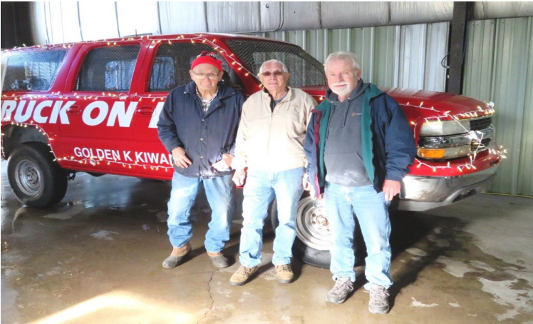
Decorating at the garage