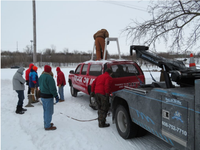
Getting things ready.