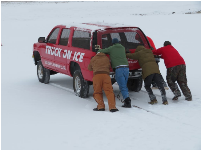
Heave Ho—Out she goes