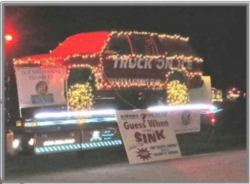
Dec. 03, 2020 Reverse Jolly Jingle Parade