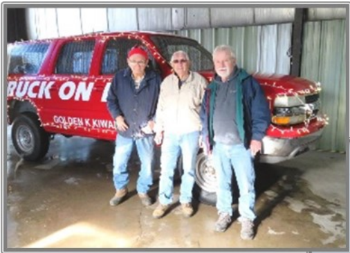
Jolly Jingle Decorating Crew