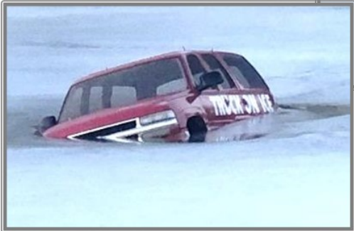
Mar. 08, 2021 The Clock Stops