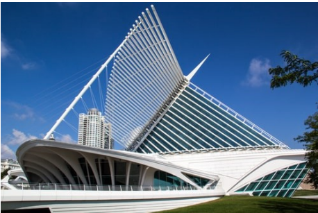
The Milwaukee Art museum. The wings of this unique building fold and unfold twice daily

The Milwaukee Art Museum, abbreviated as MAM, contains close to 30,000 works of art, and is among the largest museums to be found in the US. It used to be partially housed in a structure designed by Eero Saarinen in 1957 as a war memorial. Right from the start, the 2 lower floors were designated for art gallery use. The museum sees more than 400,000 visitors a year .