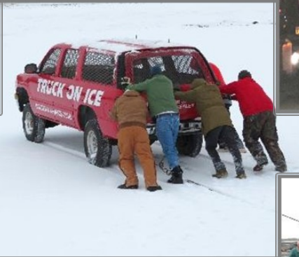
Feb 10, 2021 Launched Out on the Ice