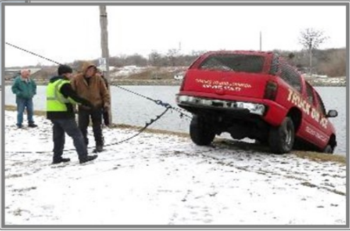
Mar 17, 2021 Pulled from the Lagoon