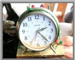
The Clock is Read Winning Time is Determined