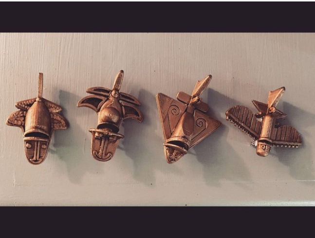
One peculiar finding from pre-Columbian South America is the Quimbaya “airplanes” of the Quimbaya Civilization (now Colombia), which are small golden artifacts that look eerily similar to modern airplanes. Of course, these “airplanes” could actually be depictions of butterflies or birds, but their likeness to modern-day airplanes is pretty strange, and it’s far more interesting to posit a conspiracy theory leading back to aliens, isn’t it?