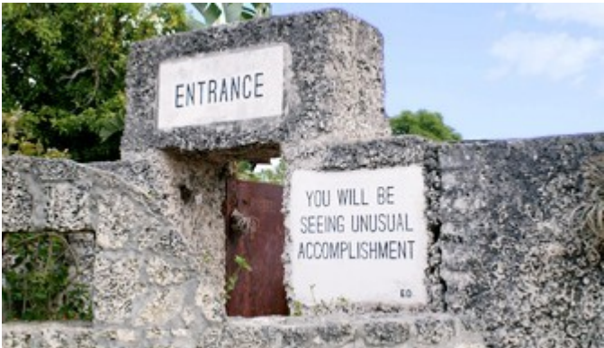
This sculpture garden in stone, built by one man, Edward Leedskalnin. From 1923 to 1951, Ed single-handedly and secretly carved over 1,100 tons of coral rock, and his unknown process has created one of the world’s most mysterious accomplishments. To this day, no one knows how Ed created the Coral Castle. Built under the cover of night and in secret, at a time when there were no modern construction conveniences, Ed would only say that he knew "the secret of the pyramids." When he died, his secrets died with him, and to this day scientists and thinkers still debate Ed’s methods

Thank you again from Mercy Hospital and me for delivering Meals on Wheels for the month of April. Golden K is recognized by Mercy Hospital for their dependable service of delivering the meals.Those delivering meals were: