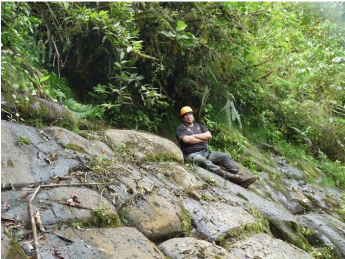
Ecuadorian legends speak of a lost city inhabited by giant humans, and in 2012, researchers discovered ruins in the Ecuadorian jungle with giant structures that would’ve been far too big for average-sized humans. The ruins, which were unknown to most people in Ecuador at the time, contained massive pyramids and tools that would’ve been impossible for humans to use. Giant human bones have also been found in nearby caves, leading us to wonder: was there a giant species of human that once walked the earth?