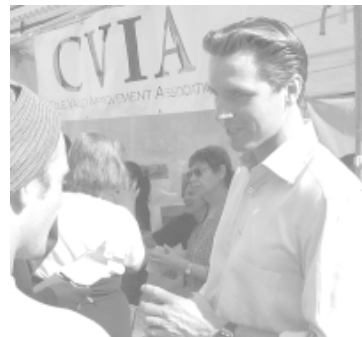
Supervisor Gavin Newsom stops by the CVIA booth at the fair.

with drinks as long as they weren't in glass containers. The difference from the Haight Street Fair was enormous. Many more babies and dogs, more interaction between people as neighbors chatted with