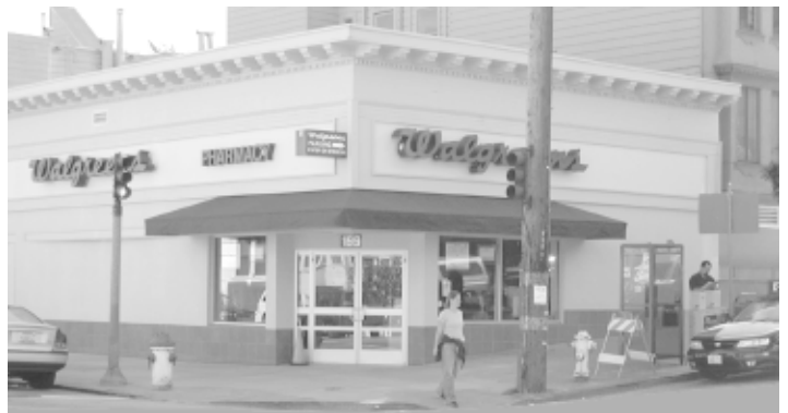
Neighbors are generally satisfied with Walgreens exterior.

The concerns that remain are the impact to traffic and safety, especially with regard to the parking lot. Because of the way it is currently striped, cars have to back out onto Stanyan to exit the lot.