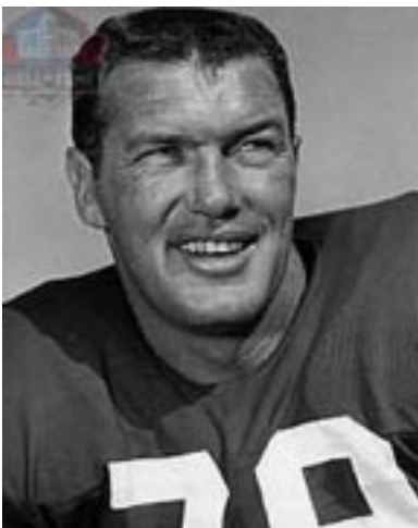
In 2001 the playing field was renamed in honor of former 49er Bob St. Clair

As a native San Franciscan who was raised across from Kezar, the event had a special significance for me. In the mid 50s and 60s my father would take me to the Kezar parking lot after the games to