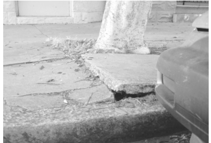
Property changes hands without new owners being aware of their responsibility for proper watering, pruning and repair of the sidewalk from root growth.

But I want to know who's taking care of the sidewalks that are destroyed by tree roots? Who is seeing to it that dead and sick trees