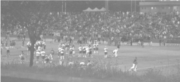
The San Francisco 49ers called Kezar Stadium home from 1946 to 1972

Approximately 4,000 fans came to the nostalgic and enjoyable event, which paid homage to the S.F. 49ers' early years at Kezar. The highlight of the evening was a ceremony honoring 72 yr. old Hall of Famer, Bob St. Clair. Two years ago the field was named Bob St. Clair Field by Rec. & Park. St. Clair was born and raised in San Francisco and is the only player in the history of the NFL to play high school, college and professional football on the same home