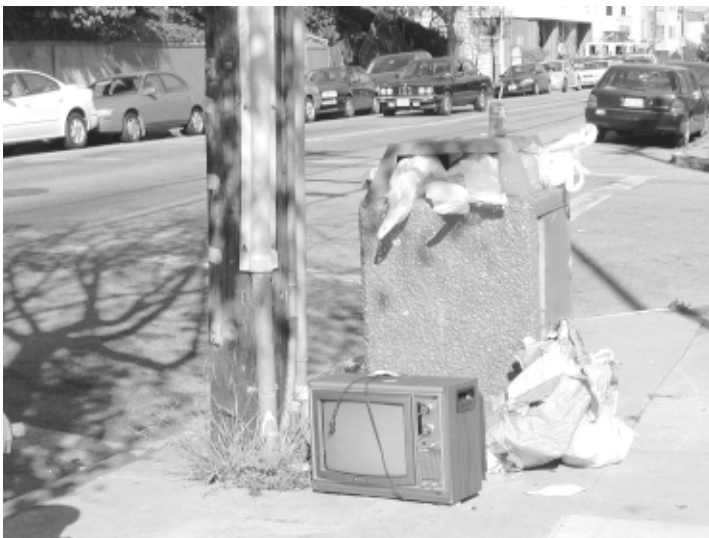
Clean streets can be achieved by raising awareness of personal responsibility and learning how to tap city services.

These groups typically do just a few things that make all the difference. 1) Carry cell phones when out in their neighborhood and call the police non-emergency number (553-0123) to report illegal behavior (ALWAYS from a safe distance). 2) Call DPW to pick up trash left on the streets (furniture, shopping carts, and dumped gar-