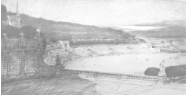
Burnham's sketch shows the Cole Valley amphitheater as he envisioned it.

Was Cole Valley actually "saved" as a residential neighborhood by the Big One? Before the 1906 Earthquake, Cole Valley was slated