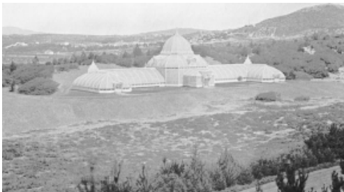
James Lick had the building prefabricated in New York by Lord & Burnham and shipped around the Horn for his estate in San Jose.

One particularly outlandish plant in the Lowland Tropics environment included the imperial philodendron that looked like a picture page torn