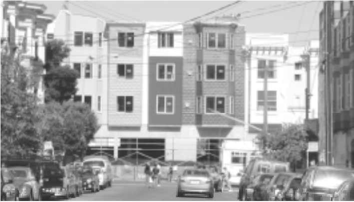
As the large, mixed-use building on Haight nears completion, questions arise over the division of retail space.

The large building nearing completion on the north side of Haight between Cole and Shrader—and adjacent to Goodwill—is a mixed use structure containing 32 residential units. The ground floor