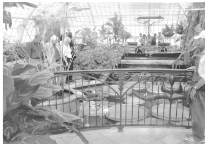
The sound of a waterfall quiets visitors to the Aquatic Plants dome.

The most animated gallery must be the Aquatic Plants section where one immediately felt yet another change in temperature and humidity. Human heads appeared in a pond, reflections, propped