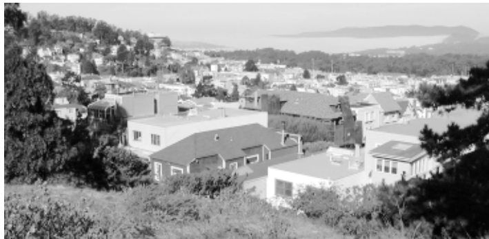
The same vantage point today from Twin Peaks Blvd., just below Tank Hill, looking northwest towards Point Reyes and the Marin Coast.

The Burnham Plan had been commissioned in 1904 by a group of San Francisco's leading citizens, who were concerned that the city was beginning to lose its absolute West Coast dominance to