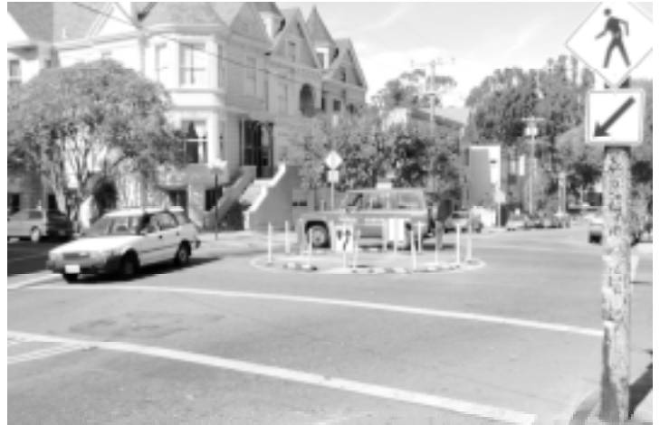
The traffic circle at Ashbury and Page is one of five getting mixed reviews.