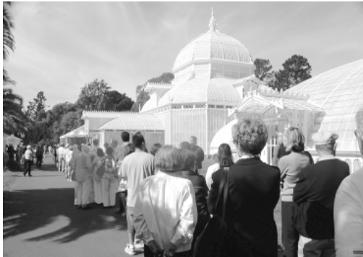
A Saturday morning crowd waits patiently to enter the just-reopened Conservatory of Flowers.

One walkway led to a dahlia garden. Another to a pedestrian tunnel. Today though we were headed where few had walked in