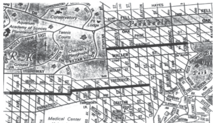
Because both Haight and Carl streets are designated as "transit corridors," adjoining neighborhoods would be subject to rezoning.

Whether you agree that these changes should be adopted or not, it is important that San Franciscans, especially those in the ar-