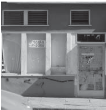
Gary's Cleaners: Gone!