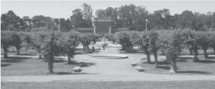
Landscape architects ask that the plane trees of the Concourse be considered part of a legacy worth preserving.

The Music Concourse and its trees are part of every San Franciscan’s heritage. They provide shade needed by elderly people