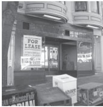
Manhattan Bagel: Gone!