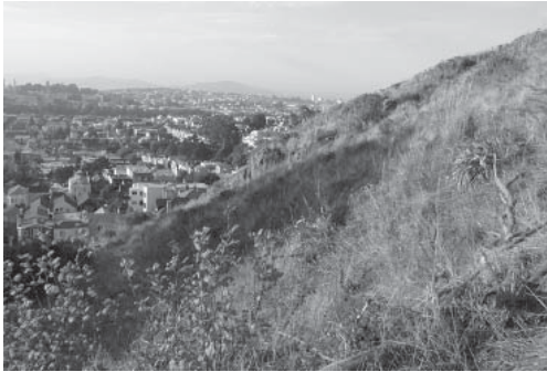
Tank Hill's wide variety of native species is the result of thousands of hours of volunteer labor.

What can be achieved and what is already happening in the city's Natural Areas is turning s u m m e r - scorched fields and slopes of