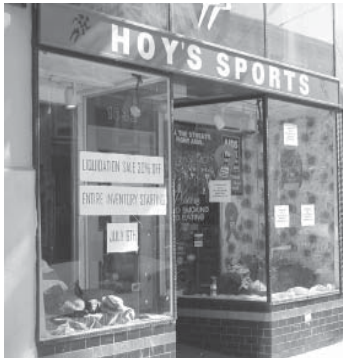
Hoy's Sports: Going!