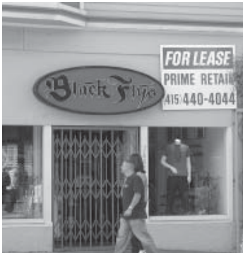
Black Flys: Gone!