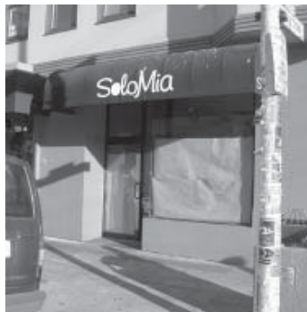
Solo Mia: Missing!