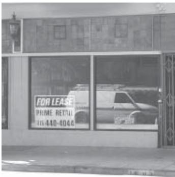
Something Else: Gone!