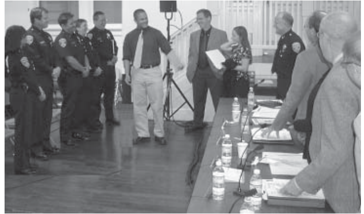
The SFPD command staff and commissioners rise to honor the Haight's Good Samaritans at the Police Commission's annual meeting at the Park Branch library in May.

The police commission's annual meeting in the Haight was the occasion of a moving tribute to a young couple who intercepted the