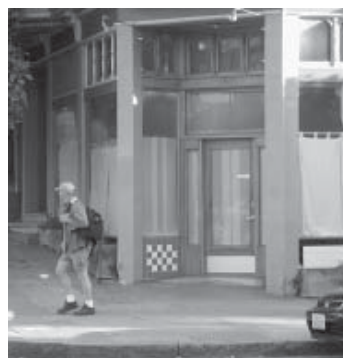
Setana Sport: Gone!