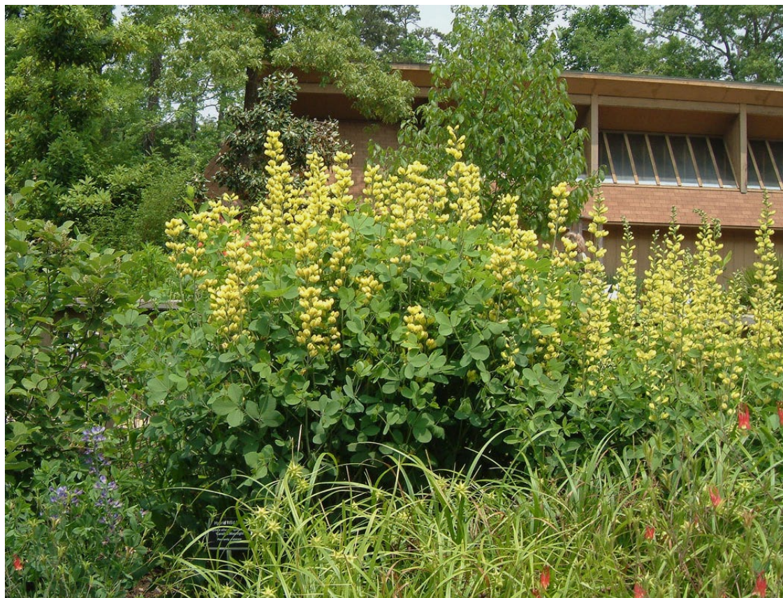
'Carolina Moonlight'. North Carolina Botanical Garden, Chapel Hill, NC. Spring 2003. Sitting pretty in the home garden where it was bred.

Baptisia x sulphurea 'Carolina Moonlight' ( B. sphaerocarpa x B. alba ) (1 / 02)