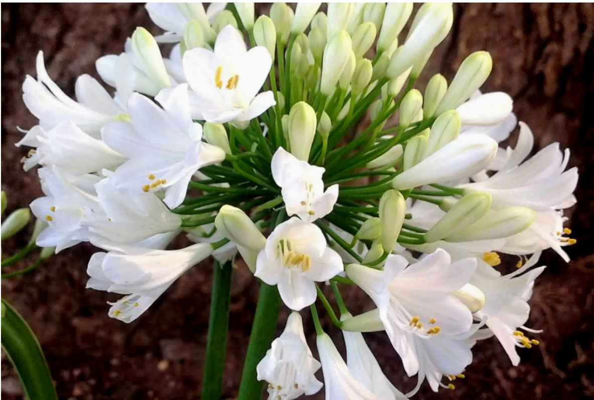
Agapanthus EVER WHITE™ is low, floriferous, durable, and like the others in the series, proven over time.