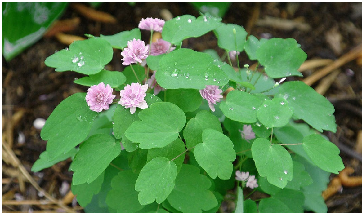
Plant Delights Nursery, May 2004. If there is any woodland plant so complex and classy I cannot think of one. Another shot of PDN stock, this time in 2018.