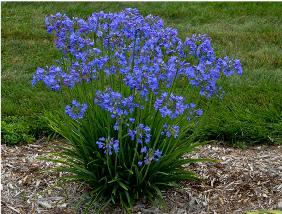
'Little Galaxy' is small and convenient for most gardens where cold hardy (USDA 6) and while each head is sparsely flowered the number of blooming stalks is larger and compensates well. Walters Gardens bred it and says it's lived over 7 years in their snowy USDA 6. Their regular 'Galaxy Blue' is much taller.

AGAP004 – Agapanthus africanus 'Little Dutch Blue' – 18–24 in. or about 70cm tall, short, compact, scapes strong, upright. Flower numerous (floriferous), notably star-shaped (not wide campanulate), long bloom period (longer than 'Peter Pan', corolla pale blue overall, outside tinged medium violet-blue, internal of tepals slightly centered in violet blue on pale blue. Reliable garden performance including container culture. Pat: US# 26268 to Anthonius Rijnbeek, Netherlands on 12.22.2015, as sport of 'Blue Heaven'.