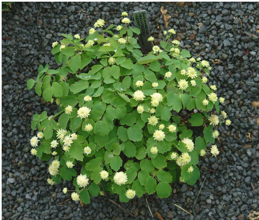
Juniper Level Botanic Garden. May 2004. If you can find a more pretty spring perennial than this...you must be in heaven.

fc: center light yellowish-green, older and outer petals more greenish-white ft: double