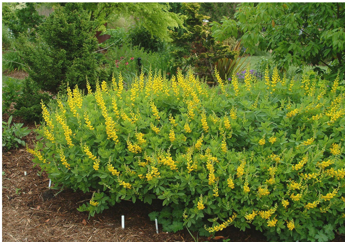
'Screaming Yellow'. Plant Delights Nursery. May 2004. One of the good floriferous clones of reasonable size and density.

Baptisia sphaerocarpa 'Mello Yellow' (12/2001) ht: 2–3 ft. fc: light yellow lc: greyish–green, greyer than species typical or: Univ. Delaware Bot. Gard. from same seedlot as 'Gold Dust'