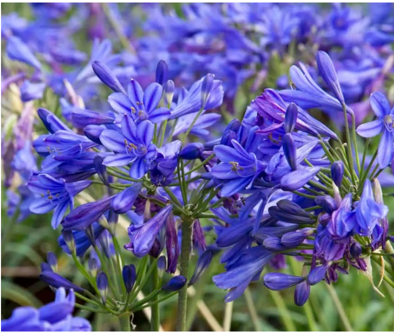
LITTLE BLUE FOUNTAIN is 16–18 inches tall and full of these glowing cobalt blue flowers with darker stripes inside.

AGAP004 – Agapanthus africanus 'Little Dutch Blue' – 18–24 in. or about 70cm tall, short, compact, scapes strong, upright. Flower numerous (floriferous), notably star-shaped (not wide campanulate), long bloom period (longer than 'Peter Pan', corolla pale blue overall, outside tinged medium violet-blue, internal of tepals slightly centered in violet blue on pale blue. Reliable garden performance including container culture. Pat: US# 26268 to Anthonius Rijnbeek, Netherlands on 12.22.2015, as sport of 'Blue Heaven'.